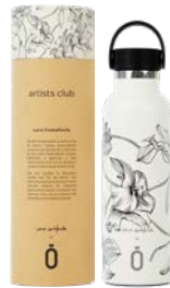
night flower 971761