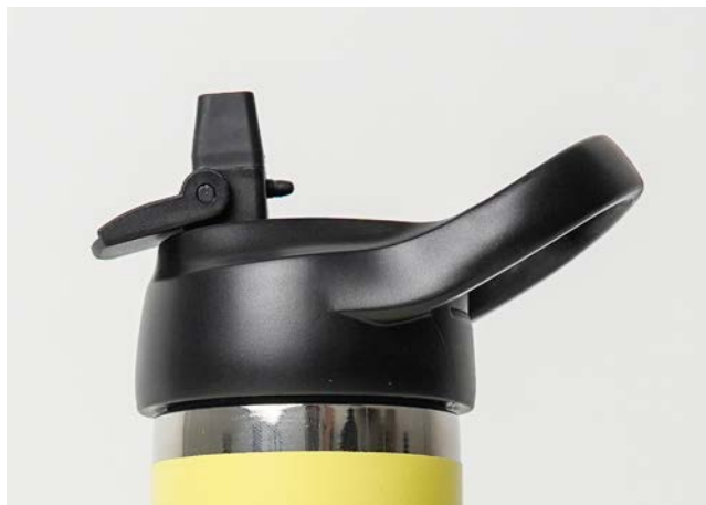
Runbott sport 35 cl.