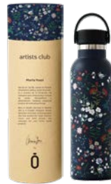
spring marino 971812