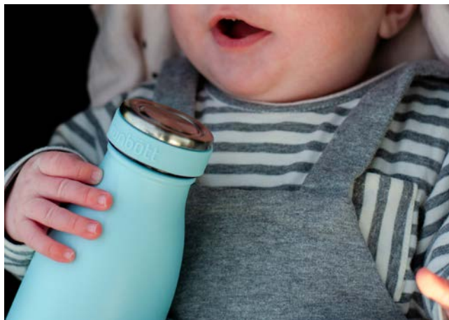
Runbott city 35 cl.