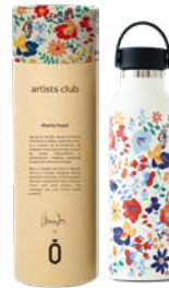
spring nata 971811

60 cl. thermos flask, airtight lid, inner ceramic coating, non-slip base, glitter texture.