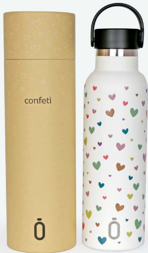
Runbott confeti 60 cl.