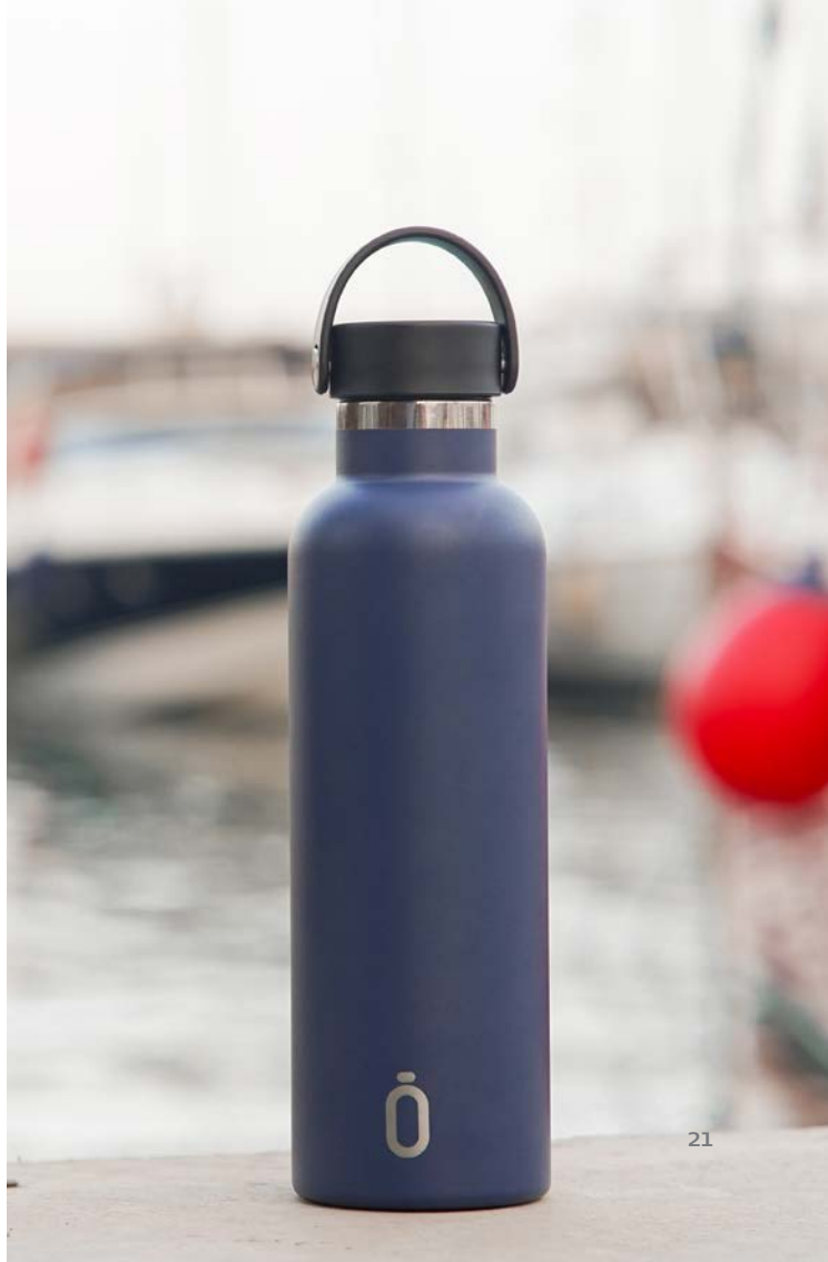
Runbott sport 75 cl.