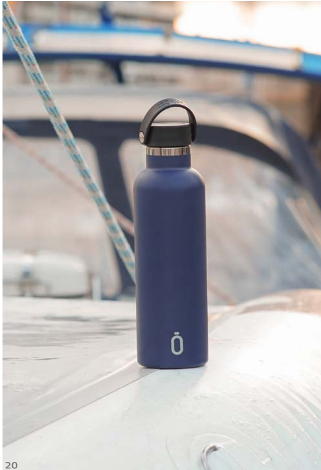
Runbott sport 75 cl.