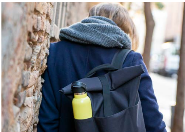
Runbott sport 60 cl.