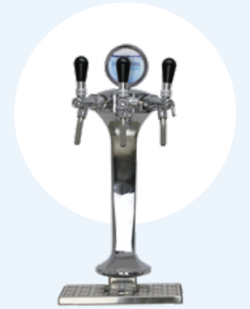
Mechanic water dispenser tower Borne

Electronical column made of stainless steel. Elegant and modern design. One outlet and three types of water. Configurable dispensing volume. Water and dose selection with touch-sensitive buttons. Tray included.