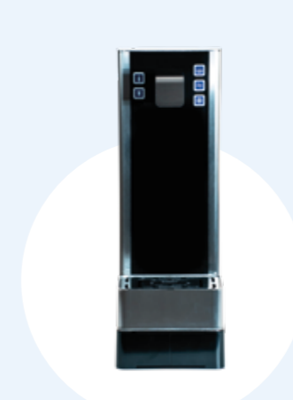
Water dispenser tower Arenal

Column in white ceramic finish. With 2/3 dispenser taps. Includes stainless steel tray.