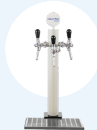
Mechanic water dispenser tower Ribe

Column in white ceramic finish. With 2/3 dispenser taps. Includes stainless steel tray.